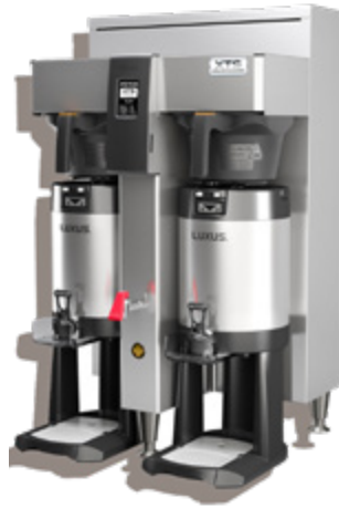
Fetco CBS 2152 XTS