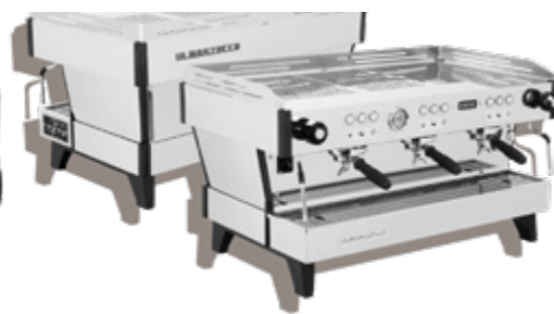
La Marzocco Linea Classic