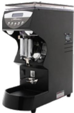
Nuova Simonelli Mythos Clima Pro