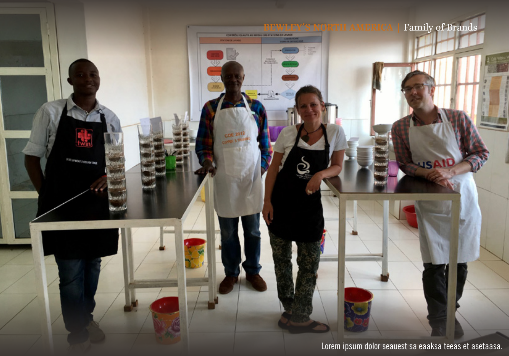
Lorem ipsum dolor seauest sa eaaksa teeas et asetaasa.