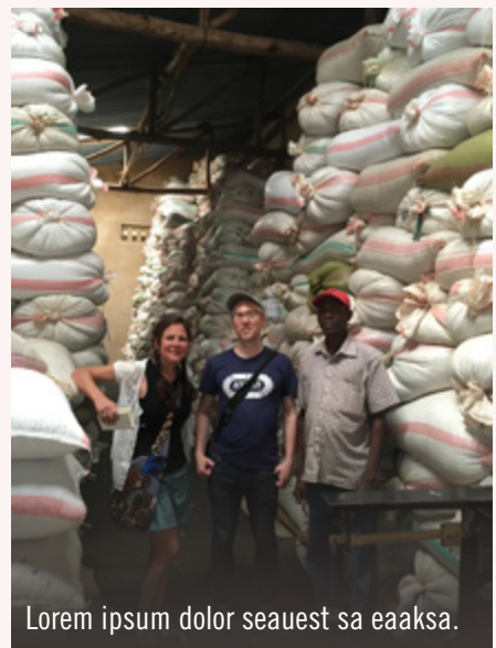
Lorem ipsum dolor seauest sa eaaksa.

I'm delighted to be joining the Bewley's NA team in Sacramento and look forward to meeting you!