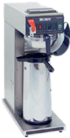
Bunn CWTF-APS DV