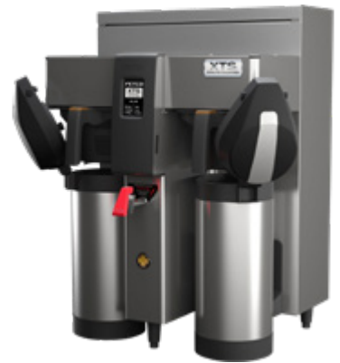
Fetco CBS 2132 XTS