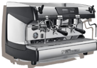
Nuova Simonelli Aurelia