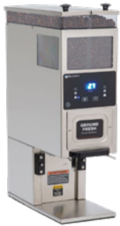
Bunn G9-2T DBC 2 Hopper