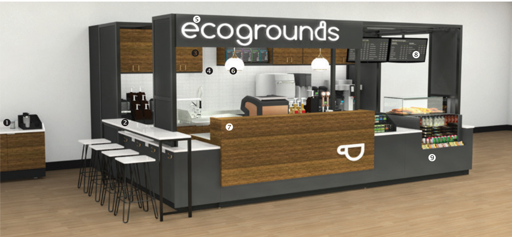
^ Featured above is the medium ecogrounds store system