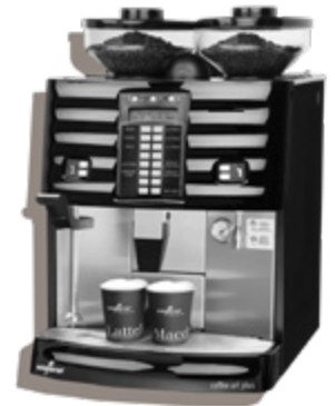
Schaerer Coffee Art Plus